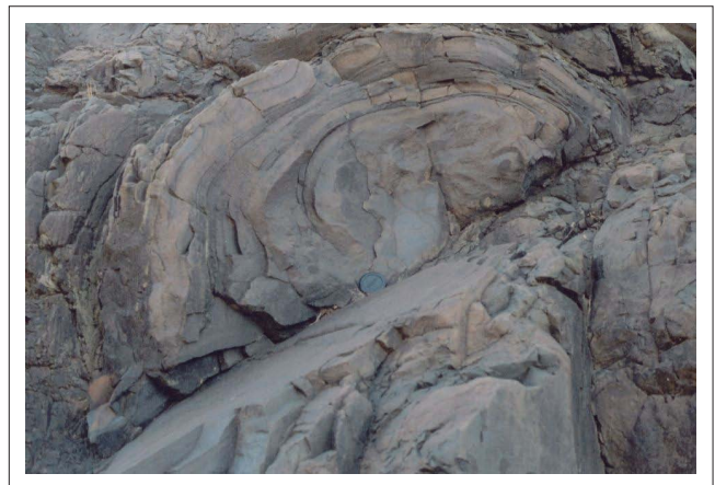
Scale: 60-mm lens cap diameter.