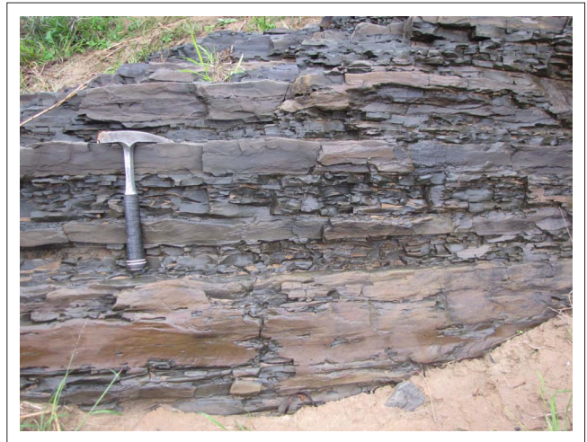
Scale: geological hammer.

Facies D comprises thick (> 0.5 m) beds of bluish-grey (5B 7/1) horizontally or ripple-laminated sandstone. The convex basal contacts are erosional and in many places contain flame structures when underlain by argillaceous beds. The sandstones are more extensive than those of Facies C and may extend more than 100 m laterally. This facies becomes more abundant towards the top of the Facies Association 2 sequence, producing an overall upward coarsening trend to the succession. Matrix supported, well-rounded intraformational mud pebble horizons with no apparent imbrication occur in places within Facies D sandstones, whilst thin mud flakes resembling 'acicular structures' 23 also occur at various horizons. These structures