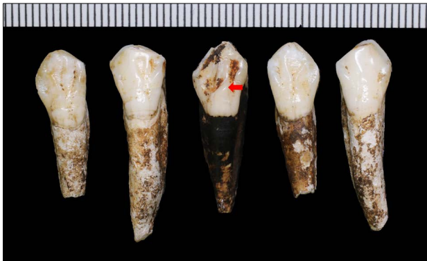
Figure 1: Lingual view of StW 585 from L/63 area of Lincoln Cave (centre) and Homo naledi maxillary permanent canines from the Dinaledi Chamber. Left to right: U.W. 101-337 RC, U.W. 101-908 RC, StW 585 RC, U.W. 101-501 LC, U.W. 101-412 LC. Arrow shows large tuberculum dentale of StW 585.

more mesiodistally curved, i.e. the mesial and distal crown edge curve inward toward the midline of the tooth, more than H. naledi specimens such as U.W. 101-337 (Figure 2). The crown of StW 585 is short and robust relative to its overall size while H. naledi canines appear tall (Figure 2, Figure 3).