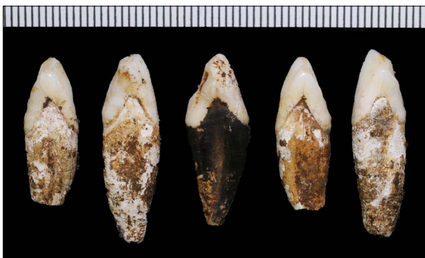
Figure 3: Mesial view of StW 585 from L/63 area of Lincoln Cave (centre) and Homo naledi maxillary permanent canines from the Dinaledi Chamber. Left to right: U.W. 101-337 RC, U.W. 101-908 RC, StW 585 RC, U.W. 101-501 LC, U.W. 101-412 LC.

The StW 585 and H. naledi canines do share several traits, including, lingually, a mesial crest that is shorter than the distal crest, and a mesial shoulder that is more apically placed than the distal shoulder (Figure 1). The labial face is minimally curved incisocervically in both StW 585 and H. naledi (Figure 3). All have a mesial crest that is more concave than the distal counterpart. Also, the mesial and distal labial grooves are weakly expressed in all canines. A deep groove runs along the mesial length of the root, with a shallow groove along the distal length. StW 585 falls within the absolute size range of variation for H. naledi (Table 1). While root length is not a conclusive feature for determining species, StW 585 overlaps in size with the H. naledi sample.