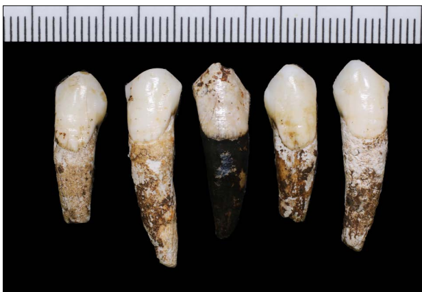
Figure 2: Labial view of StW 585 from L/63 area of Lincoln Cave (centre) and Homo naledi maxillary permanent canines from the Dinaledi Chamber. Left to right: U.W. 101-337 RC, U.W. 101-908 RC, StW 585 RC, U.W. 101-501 LC, U.W. 101-412 LC.