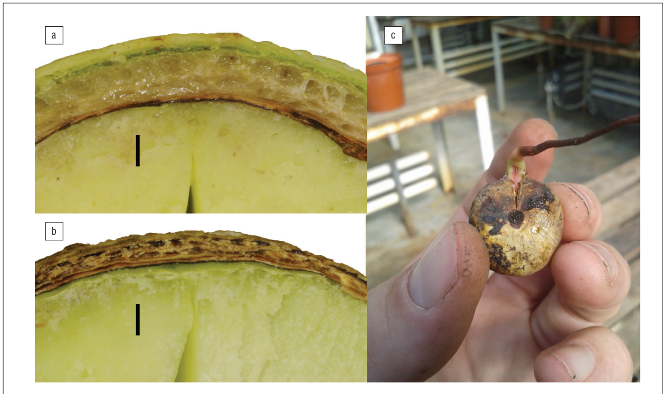
(a,b) Scale bar = 1 mm