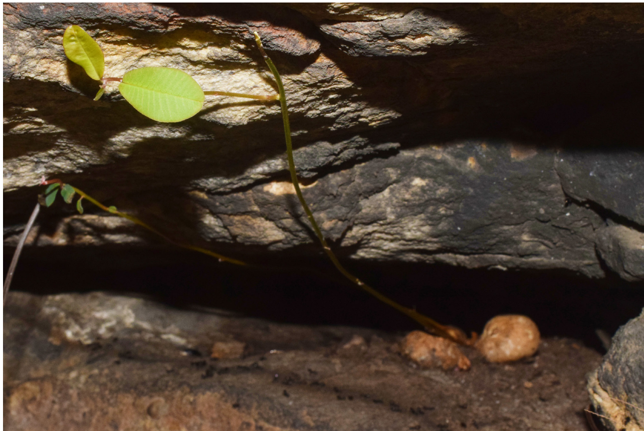
Figure 4: A Heeria argentea seedling emerges from a dark, rocky crevice at Limietberg Nature Reserve.

The three classic examples of directed dispersal are somewhat controversial. Mistletoe seedlings can only establish on thin, sun-exposed branches with only specific bird species, such as Dicaeum hirundinaceum (mistletoebirds), considered able to disperse seeds to these sites. That generalist birds, marsupials 17 , explosive seed release 18 and the wind 19 also effectively disperse mistletoe seeds weakens this argument. Myrmecochory (ant-dispersal) has been suggested as a mechanism for directed dispersal to ant nests (localised sites of high nutrients in nutrient-poor shrublands), but some evidence suggests otherwise. 20,21 Scatter-hoarding by rodents can be 'directed' to sites of low adult conspecifics. 22 However, the benefit of these sites is escape from seed predators. H. argentea fruit dispersal is possibly the clearest global example of directed dispersal – too short-distance, site-specific and beneficial to established plants (rather than seedlings), to be explained by escape of seed or seedling predators or by colonisation of prime sites by seedlings. 16