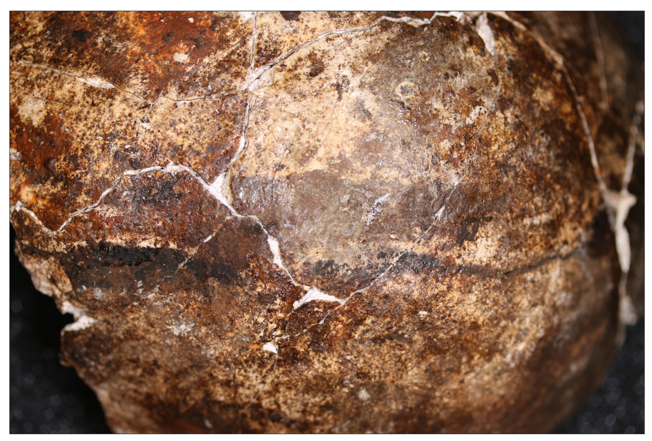
Figure 3: Specimen U.W. 101–419 Cranium A(1) displaying tide lines of mineral staining which extends across different vault fragments. Tide lines mark a contact boundary between the bone surface and surrounding sediment, and indicate the resting orientation of the bone during precipitation of the stains.

Thus the notion that snails are light-dwelling, leaf-litter feeders is incorrect, and bone surface modification by snails cannot be used to imply a close entrance to the surface or redeposition of the hominin fossil material from a location near light. Furthermore, much of the radula damage observed on the bones of H. naledi occurs after they were mineralised – therefore most invertebrate damage was probably produced inside the dark Dinaledi Chamber on bones already covered in coatings of manganese and iron oxide deposits (Figure 4).