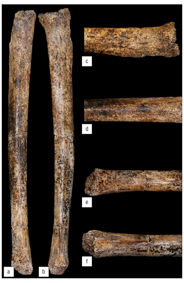
(a) Medial aspect; (b) lateral aspect; (c) close-up of anterior shaft; (d) mid shaft; (e) close-up of distal end seen in (a); (f) close-up of distal end seen in (b).

However, the distribution of Mn staining is not only on this one side of the specimen, but on all anatomical sides (anterior, posterior, medial and lateral), as shown in Figure 1. Such a distribution can also be seen on many specimens (for example, in Figure 2, specimen U.W. 101-1070, correctly attributed here). The distribution of Mn staining on the Dinaledi Chamber material is generally circumferential, occurring on multiple sides of bones. That distribution is not compatible with lichen growth in the present context, and there are significant reasons to reject the hypothesis that the Dinaledi Chamber is a secondary deposit.<sup>2,13</sup>