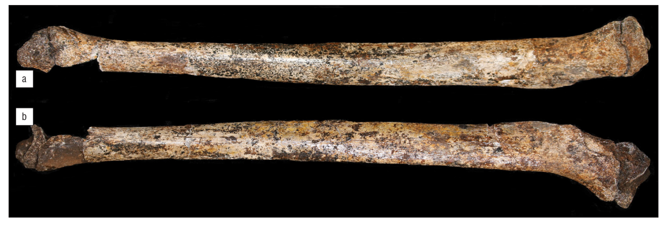
Figure 2: Patterns of mineral staining affecting tibia U.W. 101-1070. Note differential mineral staining patterns between conjoined fragments at the distal end.

In addition to lichen, Thackeray suggests<sup>1(p,5)</sup> that snails and beetles could indicate the presence of leaf litter (on which they feed), which would be found near the cave entrance and therefore in a situation with diffuse light. However, as noted by Dirks and colleagues<sup>13</sup>, snails have been recognised to colonise dark caves to considerable depth<sup>17</sup>, and are far from restricted in diet to just plant matter<sup>18</sup>. Gulella sp. and Euonyma varia (Connolly, 1910) occur in large numbers in the Rising Star Cave system, including in deep chambers in the dark zone, and may well be responsible for some of the bone surface modifications on the fossils. Subulinid snails (including Euonyma ) are largely omnivorous and are thus not dependent on green plant material as a food source (Herbert D 2016, personal communication, January 28), while Gullela spp. are carnivorous and feed mostly on other snails.<sup>18</sup>