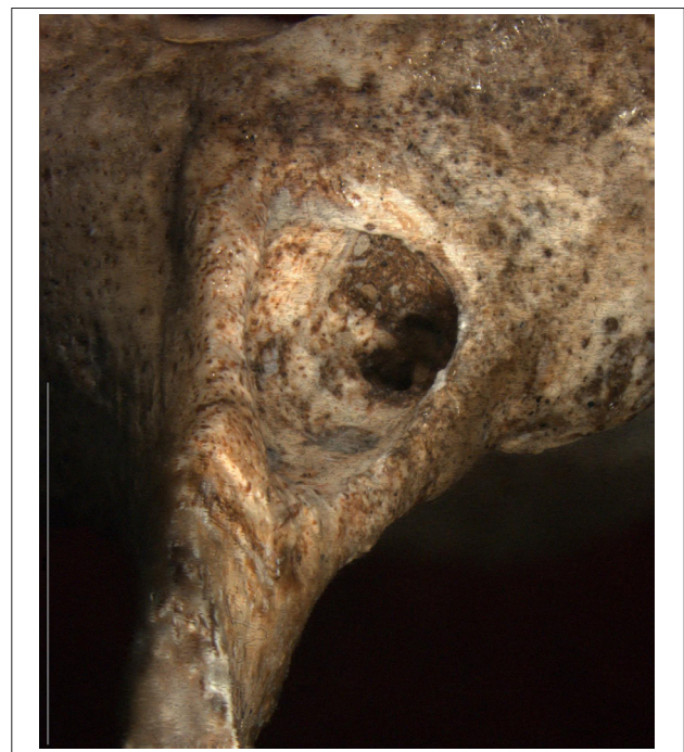
Figure 3: Vertebra U.W. 88-37. Multi-focus (composite image stack) micrograph of surface morphology of U.W. 88-37 showing sub-angular penetrating defect on the right vertebral lamina. The lesion has well-rounded edges with lateral bulging of the cortex over the lesion, indicating a reactive remodelling response to the presence of the defect. Note that anterior portion of defect remains infilled with breccia matrix. Micrograph taken with Olympus SZX Multi-focus microscope, magnification 7x. Scale bar = 10 mm.

The defect presents as a lytic lesion that extends ventrally into the lamina for much of its length, the most anterior portion of which remains infilled with breccia matrix (Figure 3). On the surface, the lesion has well-rounded edges with a somewhat sclerotic appearance. There is no evidence of periosteal or reactive bone formation on the cortex of the specimen. Viewing the right lamina from above, it appears thicker than the left lamina and bulges laterally over the lesion, indicating a reactive remodelling response to the presence of the defect.