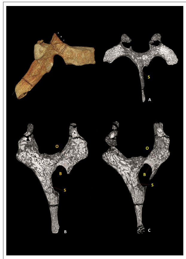
Key: S – quiescent sclerotic zone, O – active osteolytic zone, B – remaining breccia matrix infill.

at the approximate level of the superior articular facet. The internal morphology shows no involvement of the transverse process or pedicle, and the lesion does not penetrate the vertebral canal. No mineralised focal point or nidus was discerned. The edges of the first two-thirds of the lesion (moving dorsal to ventral) display sclerotic characteristics, with circumscribed margins of well-integrated cortical bone, abutted and intersected by trabecular striae (Figure 5 and Supplementary Appendix). This pattern is indicative of a slow-forming bony process, with remodelling and reorganisation of posterior aspects of the lesion. The shape of a lesion is indicative of its growth rate, with lesions that are long and oriented with the long axis of a bone indicating a nonaggressive benign process. The ventral third of the lesion, however, displays a geographic pattern of bone destruction, showing a sharp non-sclerotic margin and evidence of active osteolytic processes, with sharply-defined transection of individual trabeculae, and active osteolytic penetration into the anterior portion of the lamina. A volume-rendered negative surface model of the lesion (Figure 6) demonstrates the clear distinction between the dorsal sclerotic zone and the ventral lytic zone within the body of the active lesion.