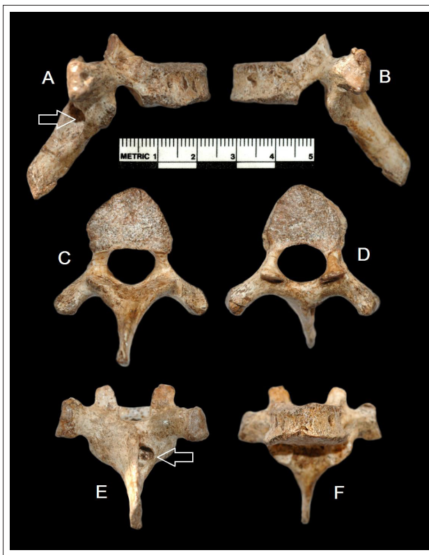
Figure 2: Vertebra U.W. 88-37. Photographs of surface morphology of U.W. 88-3 showing position of lesion on right side of vertebral lamina: (a) right lateral aspect, (b) left lateral aspect, (c) inferior aspect, (d) superior aspect, (e) posterior aspect, (f) anterior aspect. Note that apertures seen on lateral aspects of the vertebral body in images (a), (b) and (f) represent normal vascular foramina infilled with residual breccia matrix.

The defect presents as a lytic lesion that extends ventrally into the lamina for much of its length, the most anterior portion of which remains infilled with breccia matrix (Figure 3). On the surface, the lesion has well-rounded edges with a somewhat sclerotic appearance. There is no evidence of periosteal or reactive bone formation on the cortex of the specimen. Viewing the right lamina from above, it appears thicker than the left lamina and bulges laterally over the lesion, indicating a reactive remodelling response to the presence of the defect.