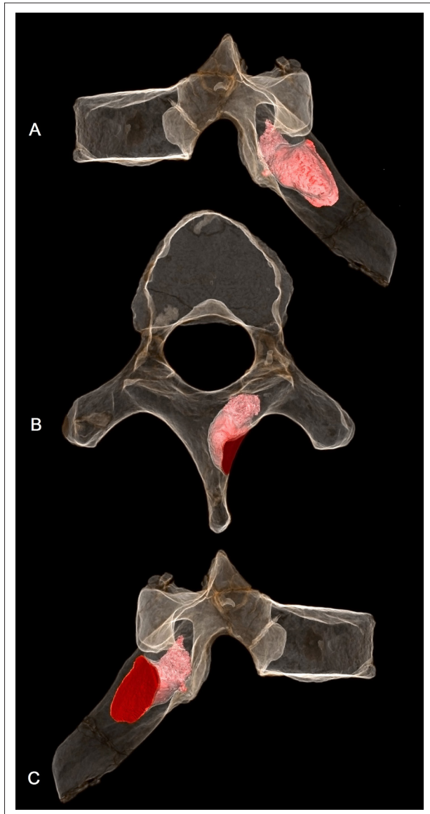
Figure 4: Vertebra U.W. 88-37. Sixth thoracic vertebra of juvenile Australopithecus sediba (Malapa Hominin 1). Partially transparent image volume with the segmented boundaries of the lesion rendered solid pink. Volume data derived from phase-contrast X-ray synchrotron microtomography. (a) left lateral view, (b) superior view, (c) right lateral view. Images produced by P.T.

Because of the presence of breccia within the lesion, the internal morphology of the specimen was assessed using phase-contrast X-ray synchrotron microtomography (performed at the European Synchrotron Radiation Facility, ESRF) and a specific acquisition protocol applied for high-quality imaging of large fossils (see Supplementary Appendix materials and methods). From the microtomographic volume, the maximum long axis of the lesion in the transverse plane measures 11.8 mm x 4.9 mm along the minor axis, with a cross-sectional area of 45.6 mm, and in the sagittal plane the lesion measures 14.7 mm x 7.9 mm, with a cross-sectional area of 68.6 mm. The internal linear dimensions are consistently less than 20 mm in diameter, which has important implications for final diagnosis.