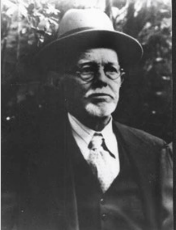
Figure 2: George William Onions (1866–1941), the hobbyist beekeeper who was among the first to make critical and detailed observations of reproductive parasitism by Apis mellifera capensis laying workers.

This ability of Cape honey bee workers to lay eggs that develop into diploid (females) individuals had been described by a little-known hobbyist beekeeper George William Onions (Figure 2), in a landmark paper describing reproductive parasitism, published in the Agricultural Journal of the Union of South Africa . 4