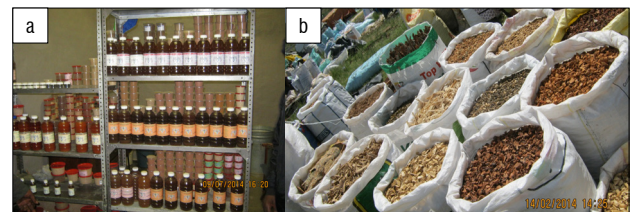
Figure 1: (a) Traditional medicine products displayed in a small traditional medicine chemist and (b) dried plant raw materials displayed by hawkers in an informal street market.

the medicinal plant trade. For example, other reports estimated that the total value of the trade was ZAR2.9 billion per annum in 2006 24 , whereas Myles et al. 25 estimated the value to be approximately ZAR520 million in the same period (2006 exchange rate 23 : ZAR6.78 = USD1). This could be because the trade is mostly informal and, at times, there is supplementation of the plant materials in South Africa with materials from neighbouring countries such as Botswana, Lesotho, Zimbabwe, and Mozambique. 24 Most of the cross-border trade in medicinal plants that was reported between Malawi and other SADC countries such as Botswana, Lesotho, Zimbabwe, Zambia, Mozambique, and South Africa, is illegal 26 and thus poorly recorded. For example, although there was no record of trade in Mondia whitei (Hook. F.) Skeels – an endangered species of high demand in South Africa – the government of Malawi reported evidence of trade in this species between the two countries. 26