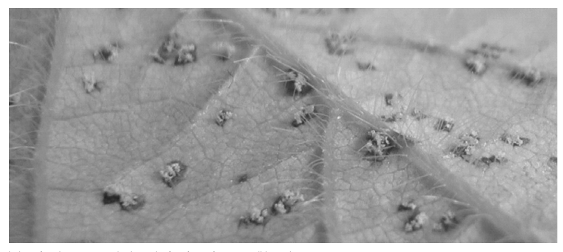
Fig. 1. Tan sporulation of soybean rust on the lower leaf surface of a susceptible soybean genotype.

with bacterial pustule disease [ Xanthomonas campestris pv glycines (Nakano) Dye].<sup>22</sup> Soybean rust symptoms generally occur first on the leaves at the base of the plant and progress up the canopy as the disease severity increases. Increased lesion density leads to leaf yellowing and ultimately premature leaf senescence, resulting in yield losses primarily through reduced grain size.<sup>23</sup>