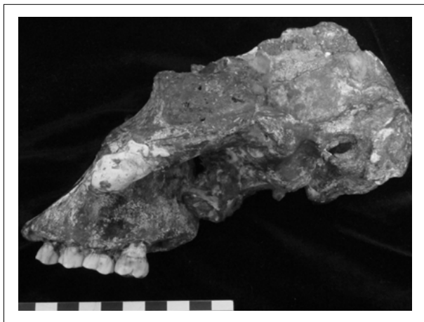
FIGURE 1 Left lateral view of the TM 1517a cranium