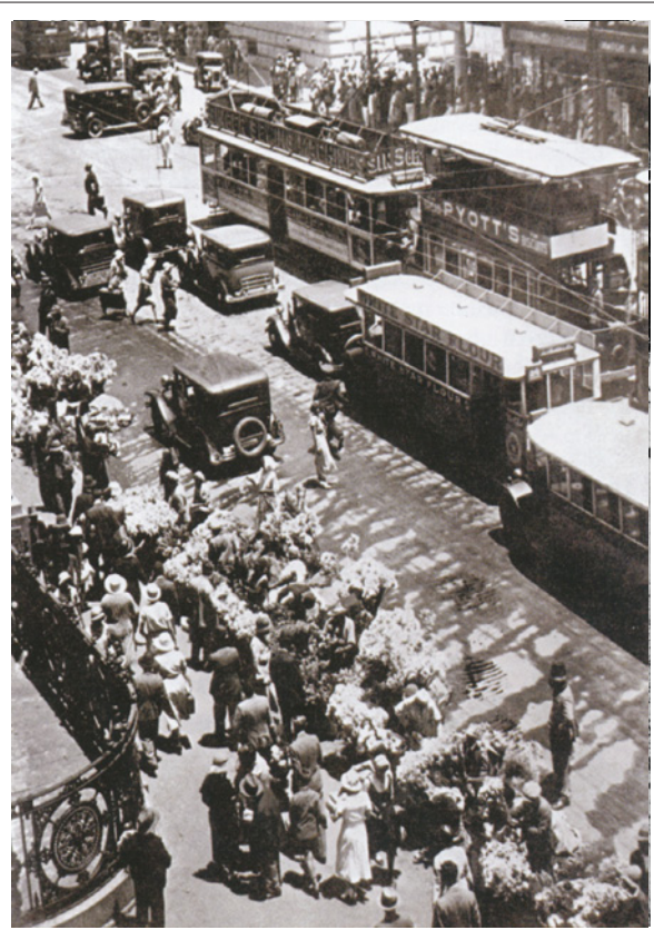
Source: E.W. Singer (ed), Cape Town's 100 Years of Progress: A Century of Local Government (Cape Town, Pennon Productions, 1968)