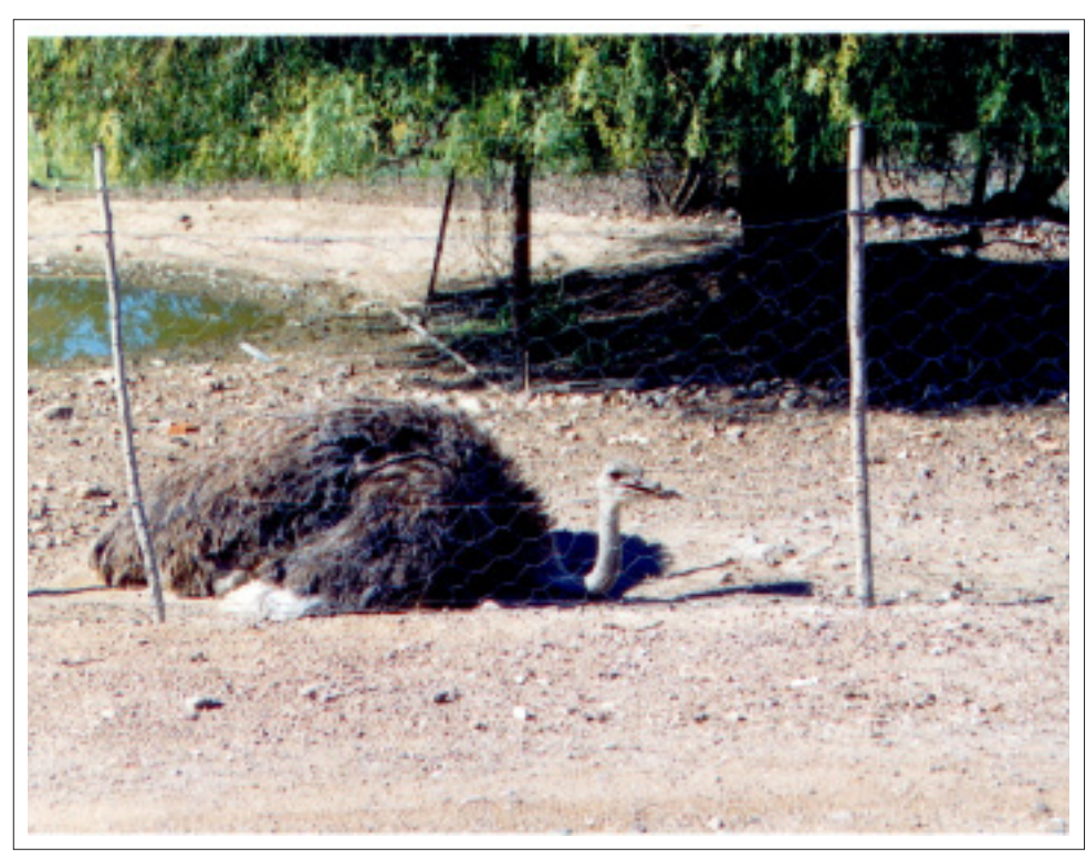
Fenced in and fed up: a farmed ostrich in the Karoo

By the early decades of the last century, the sound of such alarm bells had become deafening. To their staple worries about wildlife protection, South African conservationists added mounting concerns over pasture deterioration, overstocking, soil erosion, diminishing water supplies and other kinds of environmental blight. This chorus of conservationist anxieties and remedial ideas provided the basis for a reforming of farming practices and extensive state intervention, aimed at conserving natural resources and at regulating the agrarian environment. This blanketed not only White English and Afrikaner