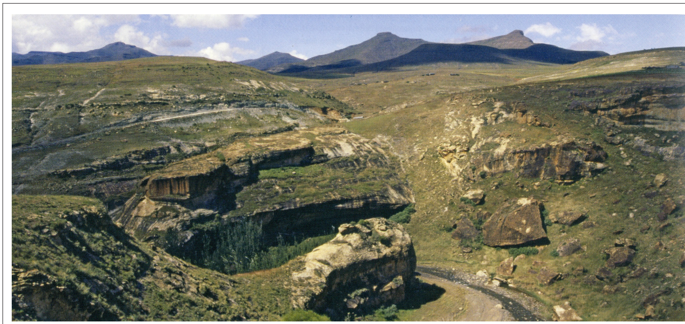
Sehonghong Shelter, one of the major archaeological sites of the Maloti-Drakensberg.