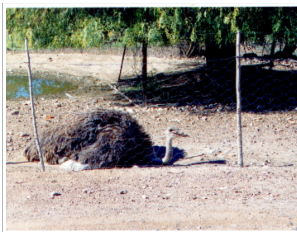
Fenced in and fed up: a farmed ostrich in the Karoo

By the early decades of the last century, the sound of such alarm bells had become deafening. To their staple worries about wildlife protection, South African conservationists added mounting concerns over pasture deterioration, overstocking, soil erosion, diminishing water supplies and other kinds of environmental blight. This chorus of conservationist anxieties and remedial ideas provided the basis for a reforming of farming practices and extensive state intervention, aimed at conserving natural resources and at regulating the agrarian environment. This blanketed not only White English and Afrikaner